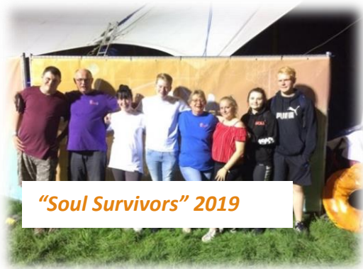
"Soul Survivors" 2019