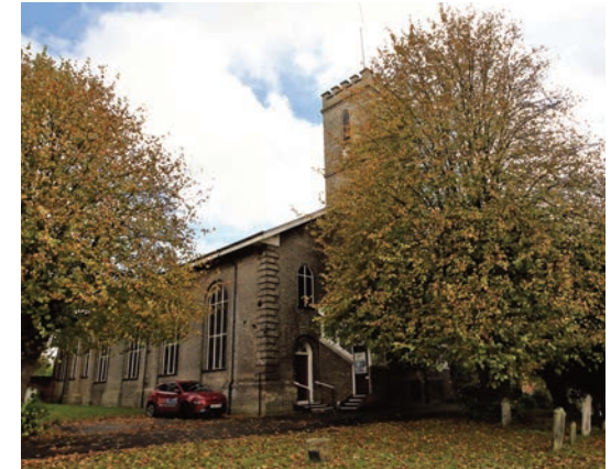
Holy Trinity Church located near the Ipswich Waterfront

Holy Trinity was built and dedicated in 1835. This is our biggest building and was our base for worship until September 2021 when, due to serious heating problems, we moved on a temporary basis to St Luke's. Holy Trinity is located a short walk from Ipswich's "The Hold", the flagship new Suffolk Archive facility/exhibition centre located on the University of Suffolk Ipswich campus. The University has 9,565 students with a chaplain who is known by our churches. Suffolk New College has 5071 students with a wide variety of courses to meet local needs.