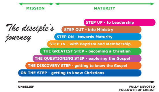
Church discipleship model

We have a weekly Monday evening prayer meeting which has run for a number of years and is led by one of four members of the laity, covering a range of topics from our local needs, individual church family members and the wider world. We previously met in person but now meet on Zoom, which has proven a real blessing for the winter months and throughout the pandemic, allowing prayer to become a firm event in our church routine. We also have a small prayer breakfast on a Saturday morning. In addition, the Benefice operates a prayer chain, overseen by a church member, whereby members of the chain receive details of prayer requests by e-mail. Prayer requests can be made by anyone connected to the church who feels there is a special prayer need for a person or situation.