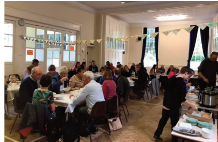
Harvest meal at Holy Trinity hall

In 2020, the Covid outbreak saw the church activities stop as we battled with a national lockdown. We began online YouTube services each week, as well as transitioning our prayer meetings, Sunday school and fellowship groups to Zoom. As new lockdowns arose, we moved the Sunday services to Zoom too, with coffee break-out rooms to help our congregation stay connected and support one another throughout the pandemic.