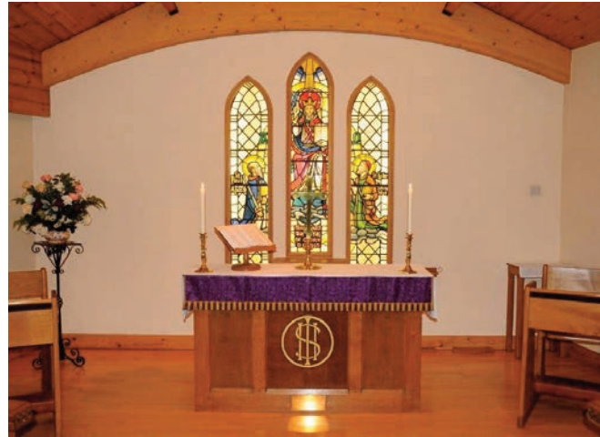
Altar and window St Luke's church