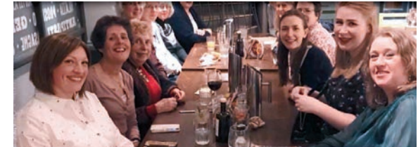
It's ladies' night at The Waterfront

We believe church is not just constrained to our three buildings or town. As part of our monthly financial giving and prayer we support two local and two international Christian charities. These are reviewed annually by the PCC to decide on the organisations to support. We provide 10% of our income to our mission partners.