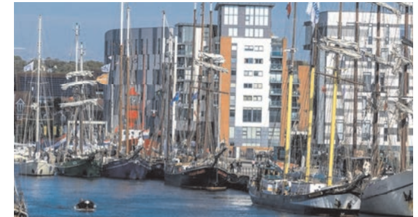
Ipswich Waterfront regularly holds community events including Race of the Classics.

We have various local attractions including Sutton Hoo, the recent setting for the Netflix film 'The Dig', Framlingham Castle, Snape Maltings and Jimmy's Farm. London can be reached within the hour by train, and a good road network connects the town to the Midlands and London area.