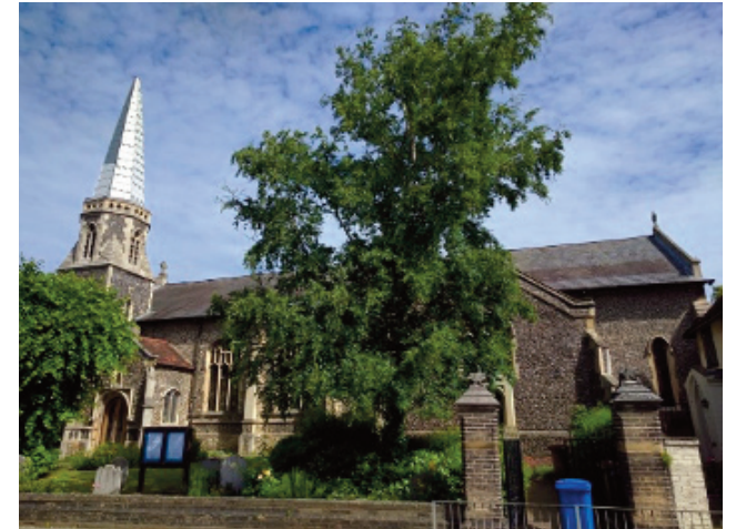
A pop-up shop in St Helen's Church, 2021