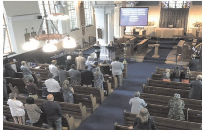
A "distanced" Sunday Worship at Holy Trinity, 2021