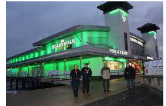
Felixstowe Pier going green