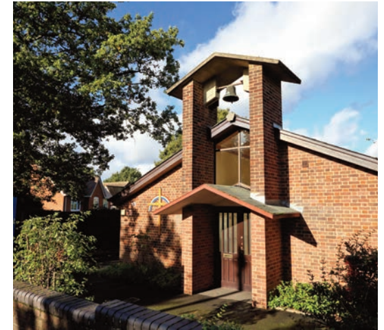
St Luke's church

The current place for our Sunday worship, located on a housing estate and opposite the local Primary school. During the week the hall is rented out by community groups. We have re-launched our weekly Coffee Pot, a morning gathering for the community attracting many residents who live on the estate known as "The Rivers." Previously, we have run a successful after-school children's group, Kids Rock, for the local school communities. We also ran Grapevine, a bustling parent and toddler session which has led to lasting friendships and support being formed with the church. In addition, prior to Covid we had a spoken 8am monthly Holy Communion service as well as a midweek short and reflective service, Time with God, which ran after Coffee Pot.