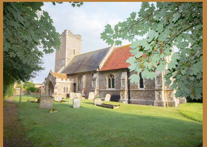
All Saints' Chedburgh; All Saints' Chevington; St Mary's Depden; St Edmund's Hargrave; St Mary's Hawkedon; All Saints' Rede