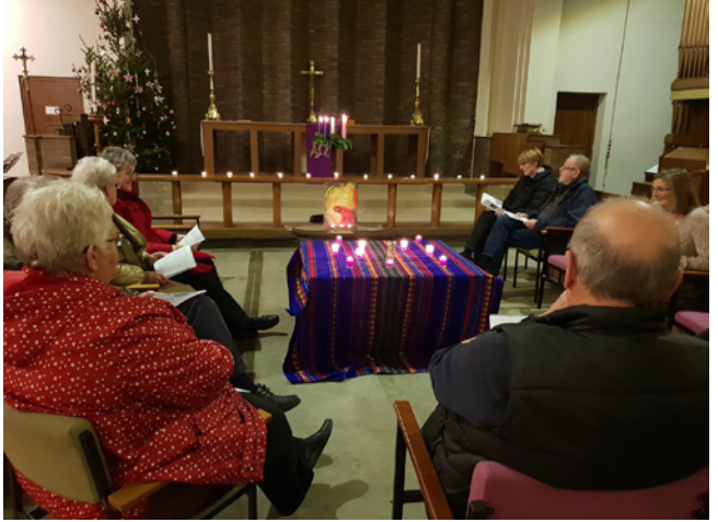
Advent Taize Service