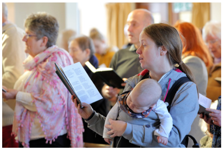
At the Sunday 10 a.m. Eucharist