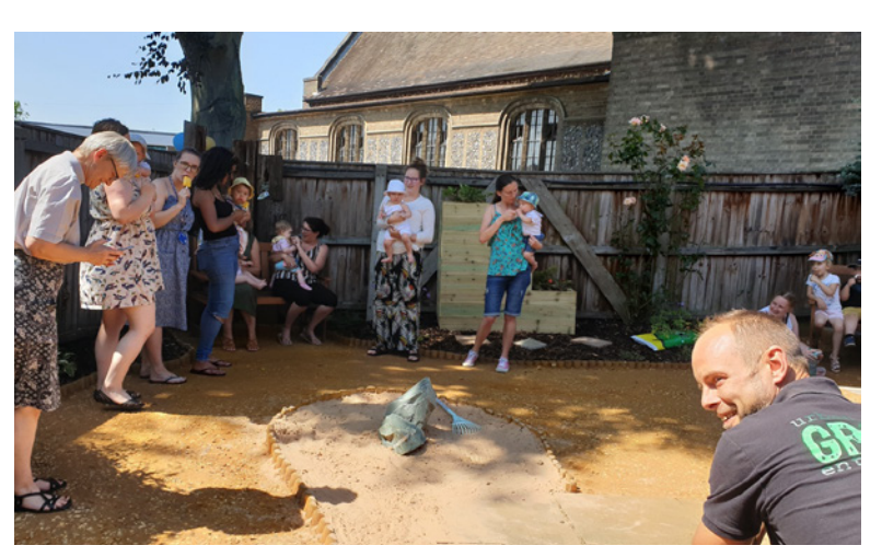
The opening of the community Peace Garden

We know that the housing needs of our new priest will come first, and have priority over other uses of the vicarage. However, we hope that our next priest will be eager and willing to support the Pilgrim Community, and as we look ahead after navigating all the changes of the last year, we seek an individual with a heart for growth and community service.