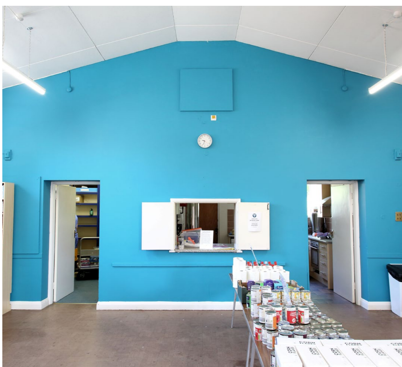
Above: Freshly painted in the summer by the youth group.

Our church building was built in 1957 to serve the growing community of Chantry.