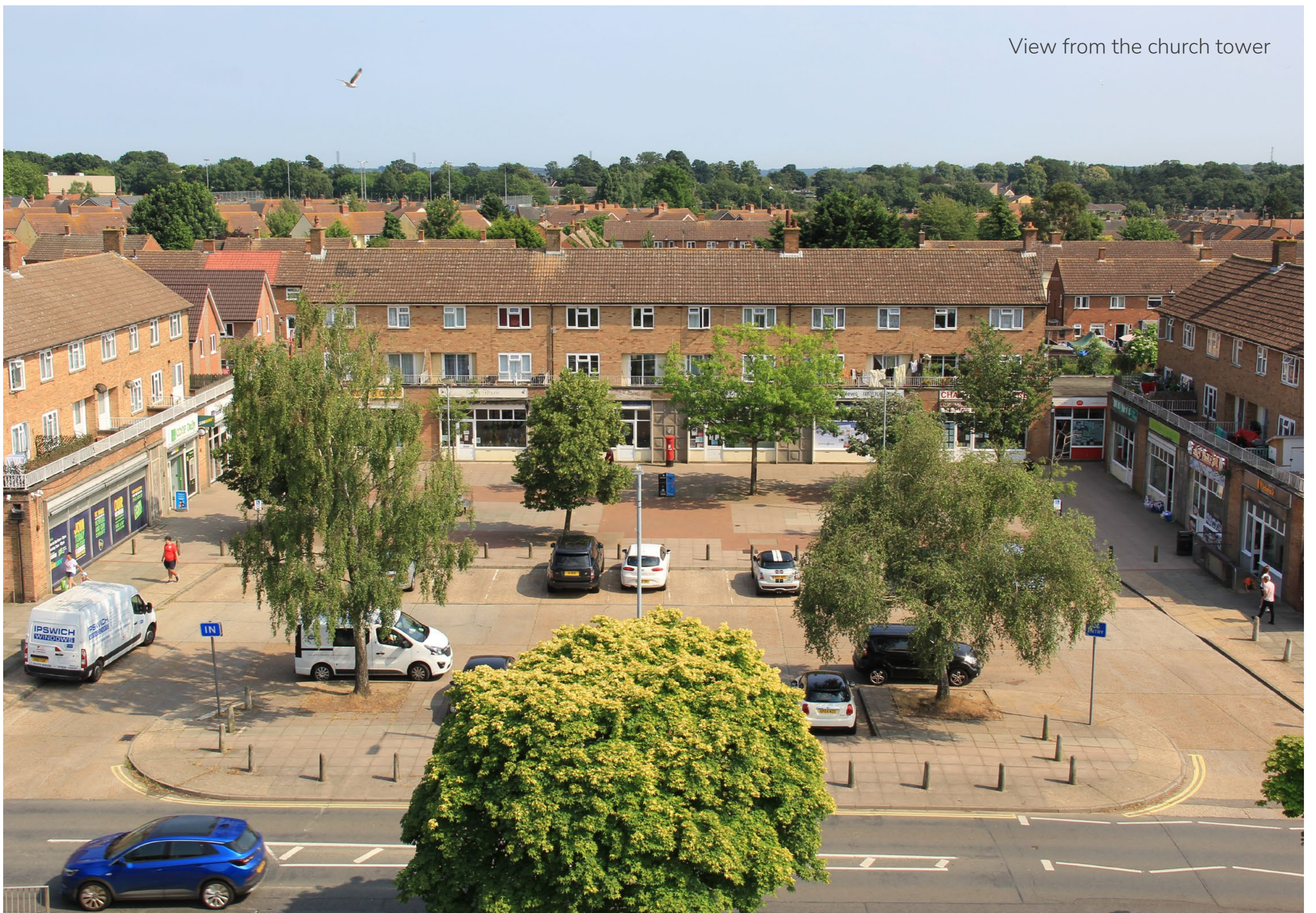
View from the church tower

Our parish, which covers the two communities of Chantry and Pinewood, is one of the largest in our Diocese with an estimated 19,400 people within its boundaries.