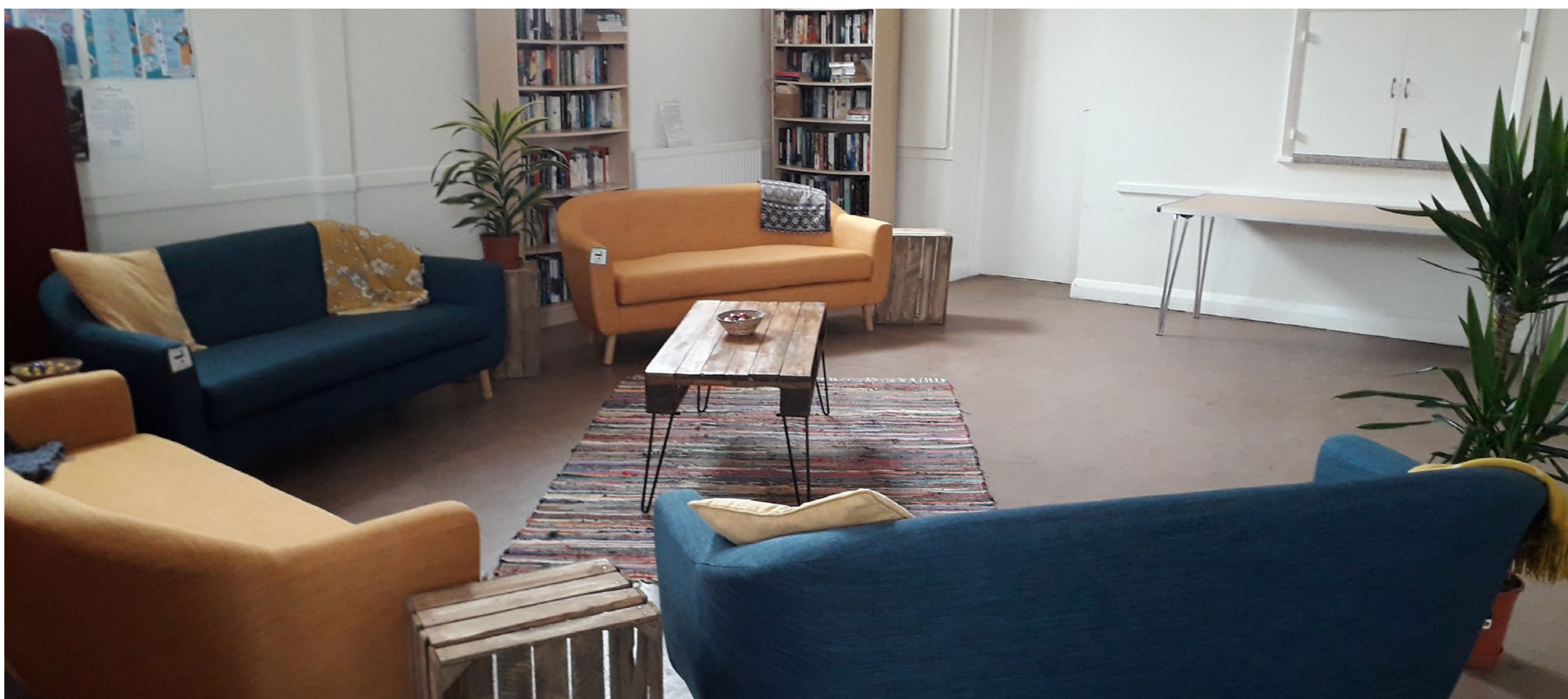
Below: Our hall set up for the youth group.

It's in good order and continues to be improved. There are chairs in the church providing a versatile space. To the left of the church we have a Holy Cross Chapel that is used for our midweek services and as a meeting room. We have a small kitchen in the adjoining hall which is used for coffee after church. We have raised funds to have this renovated and fitted with a second sink making it fit-for-purpose as a kitchen that can be used to serve food to our community. Within the crush hall we have one easy access toilet and two others in good working order.