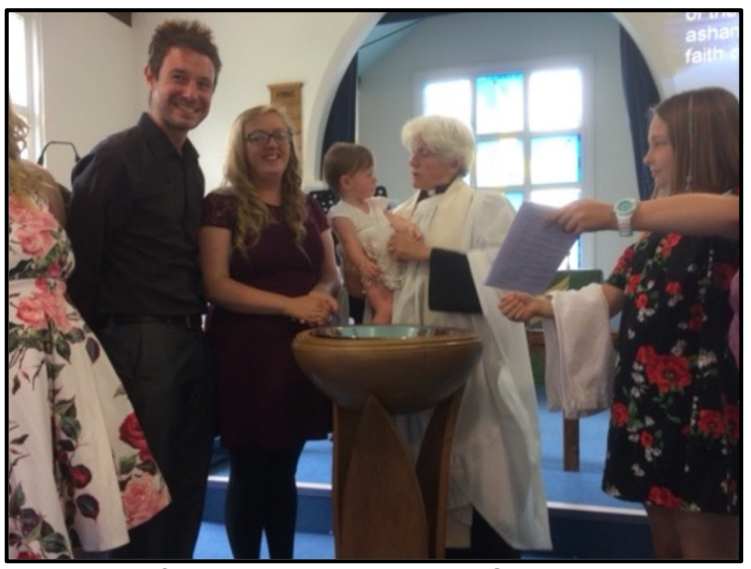
Around the font at a Baptism at All Saints, Redgrave

When St. Mary's was made redundant in 2005 the Mission Room, as it was previously known, was refurbished and consecrated as the new Parish Church of All Saints' in 2007.