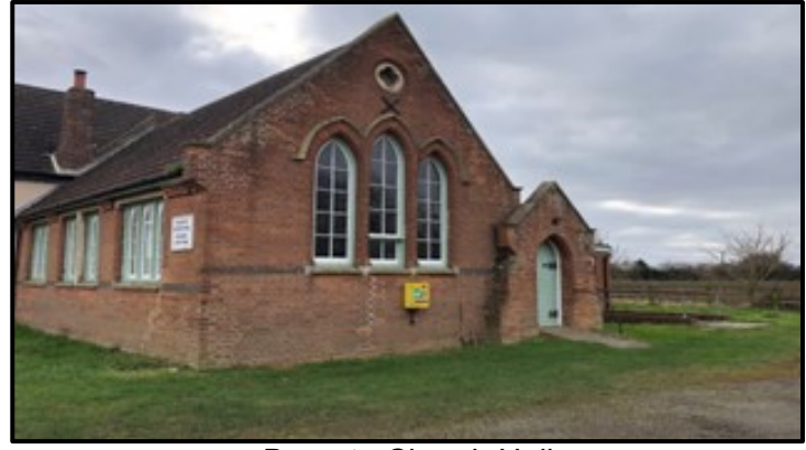
Burgate Church Hall

We have a small but active PCC and hold a yearly Christmas Fayre and Spring Garden Sale at the Church along with various other fundraising activities throughout the year.