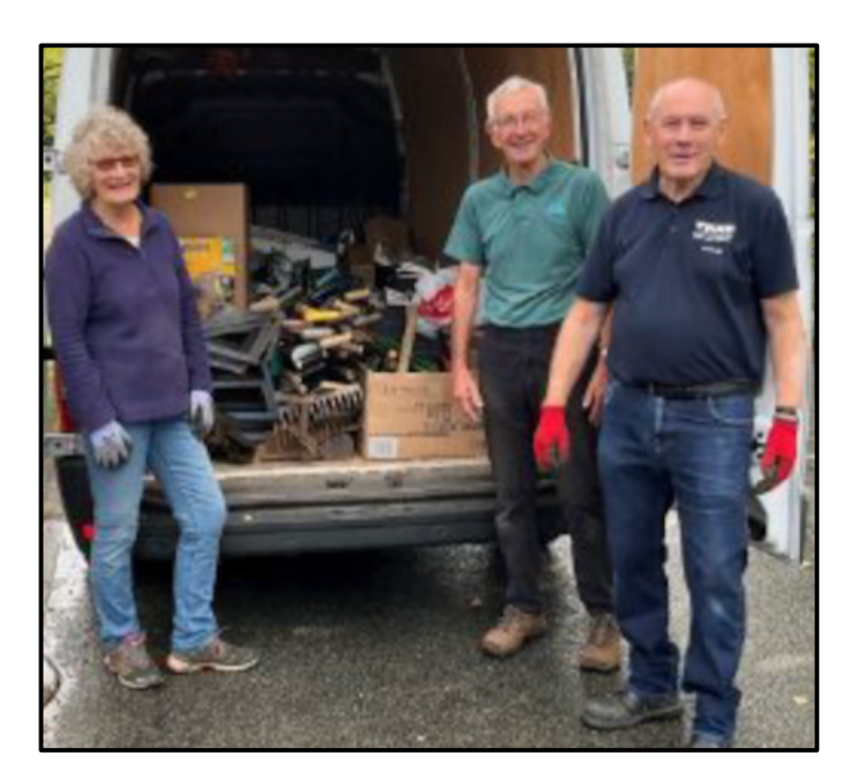
Collection of tools for Africa

Donations from 'Help for Hope' coffee mornings