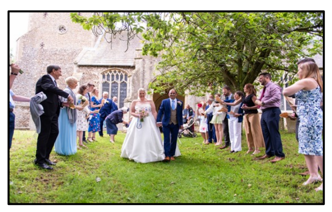
A summer wedding at Burgate

We rely heavily on volunteers to clean and maintain both the Church and the Church Hall along with a mowing rota of mainly retired gentlemen who kindly volunteer to keep the churchyard reasonably under control. We have recently set up an area of the churchyard as a wildlife garden.