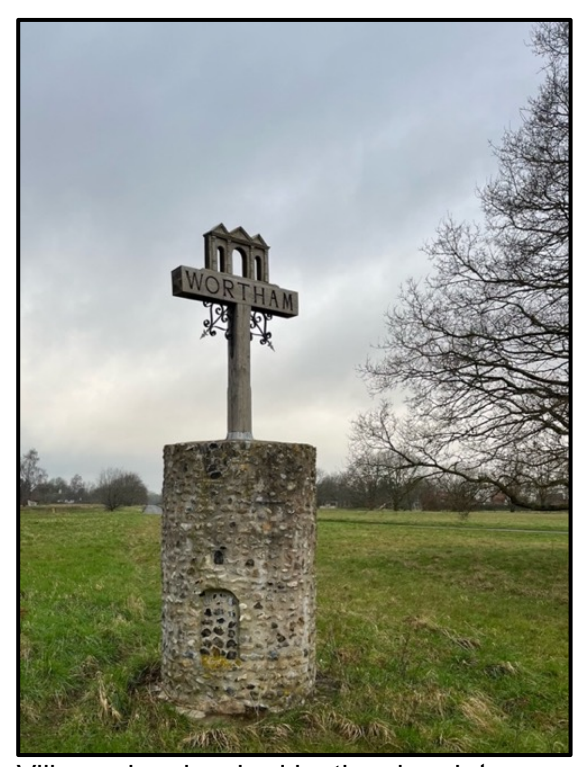
Village sign, inspired by the church tower