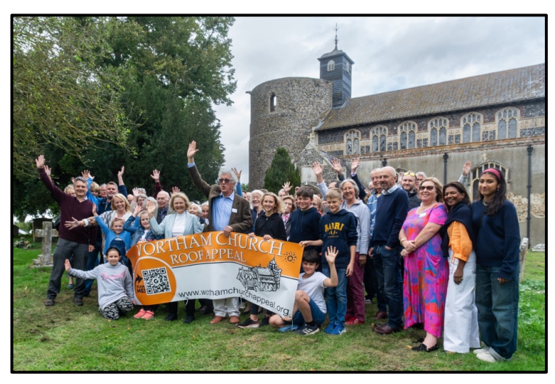
Launch of roof appeal by the Friends of Wortham Church

worthamchurchappeal.org and there are associated Facebook and Instagram pages.