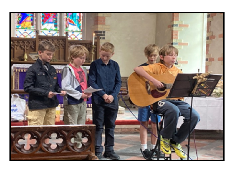
Youngsters helping at a Stuston service

We are looking forward to working alongside the Parish of Redgrave cum Botesdale with the Rickinghalls and pooling our individual strengths. We hope you enjoy getting to know us a little and if you feel you might be the right person to guide us into the future then we would love to meet you.