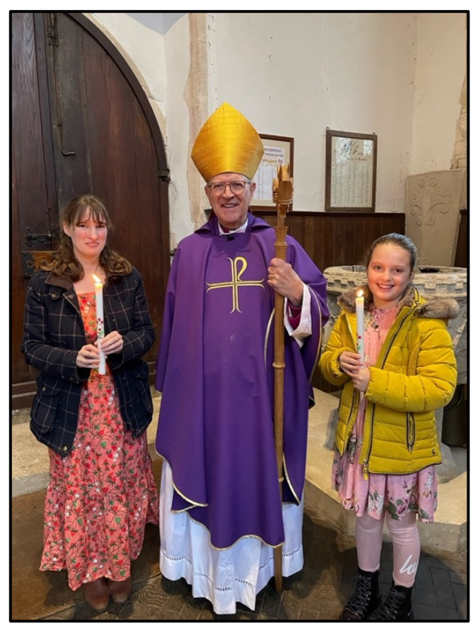
Confirmation Candidates December 2023