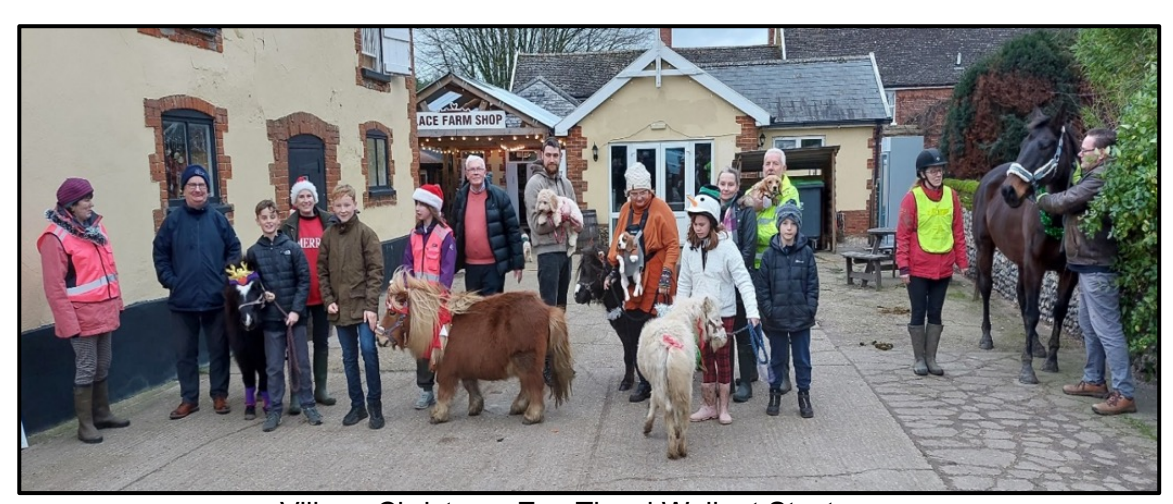
Village Christmas Eve Tinsel Walk at Stuston