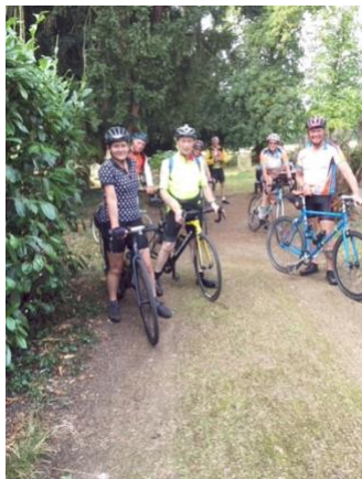
Some of the 50+ cyclists from Audax-UK – the long-distance cyclists club – enjoying a well-earned break and the hospitality of St Mary’s, Ashfield.

engaging recognise pastorally build community families encourage incumbent important team Benefice People ministry lay supportive requirements large worshipping part providing parish entrants encourage committed poor