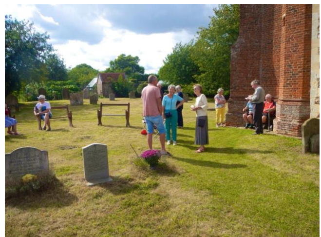
Refreshment in the sunshine St Andrew & St Eustachius, Hoo