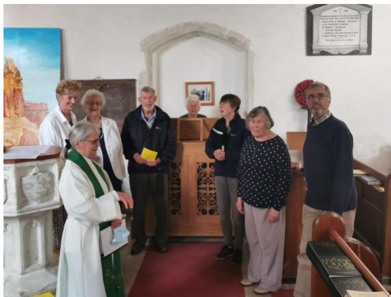
Conversation after a Service: St Mary's, Monewden.