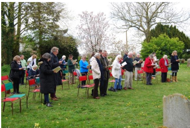
Benefice Rogation Sunday 2021 – Monewden St Mary's

We are looking for a priest who will work with, and alongside, the existing congregations and Ministry Team to explore new avenues of mission and outreach.