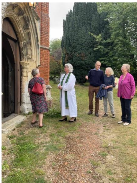
Conversation after a Service: St Peter's, Charsfield