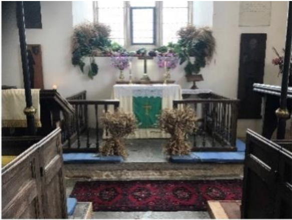
Our Festival Church: The Priory of St Mary, Letheringham