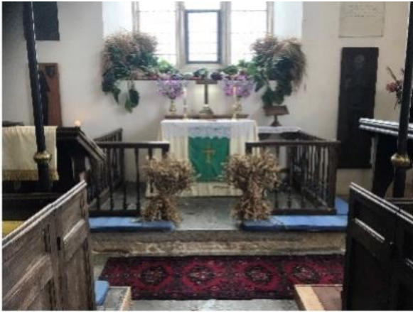
Our Festival Church: The Priory of St Mary, Letheringham