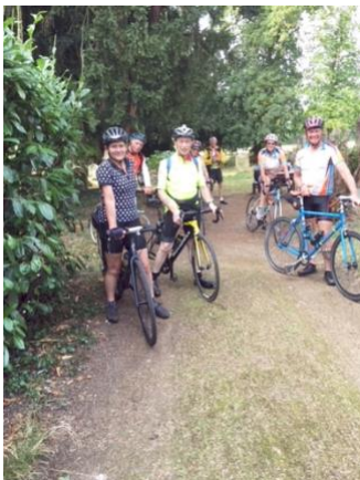
Some of the 50+ cyclists from Audax-UK – the long-distance cyclists club – enjoying a well-earned break and the hospitality of St Mary’s, Ashfield.