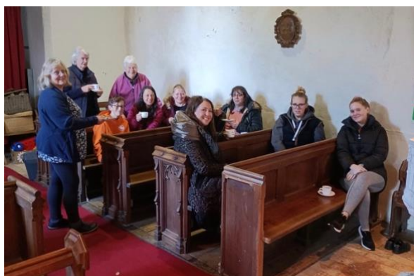
A new initiative: Coffee in the church after the school-run. St Peter’s Charsfield.