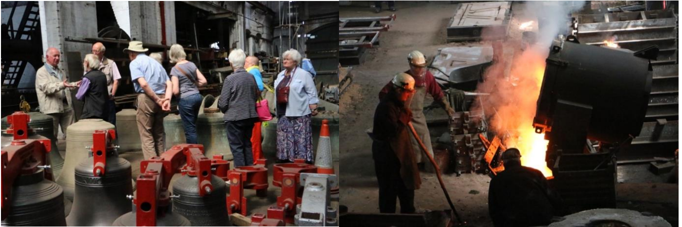
The Peace Bell Project – St Peter's Cretingham 2018 – visiting the foundry to see the casting of new bell.

The benefice website : ( www.mid-loes.com ) is regularly maintained and holds information about the Ministry Team, a pen-portrait of each church along with a local contact, that month's service schedule and an archive of past magazines. There is also an e-mail link to the Editor who can forward messages to the relevant benefice officer.