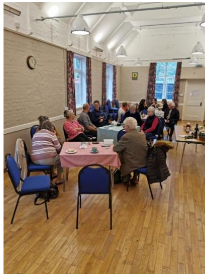
Saturday Café – St Mary's, Monewden

We are blessed in having a team of skilled and resourceful organists – many of whom are prepared to travel across the benefice if required. Occasionally, music for services is resourced from CD or other media. Currently, there are no church choirs but, especially at Christmas, small music groups are formed to augment worship.