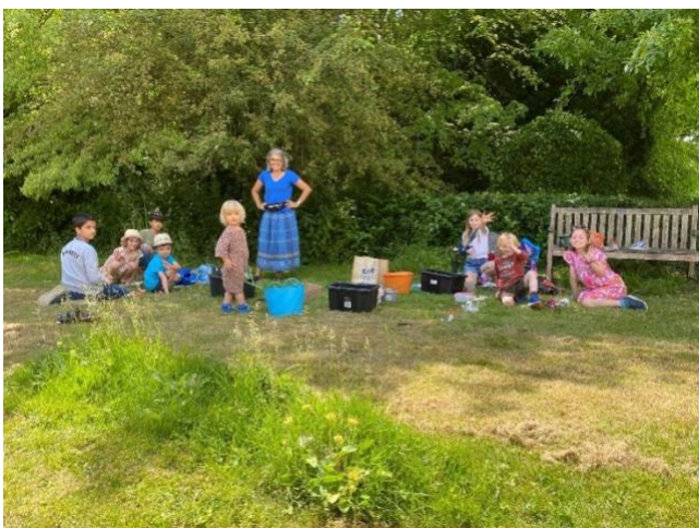
Open Gardens fundraiser – younger villagers making mini-gardens – St Mary's, Dallinghoo