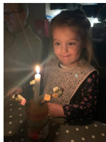
Christingle-at-Home during lockdown 2020. St Mary’s Earl Soham