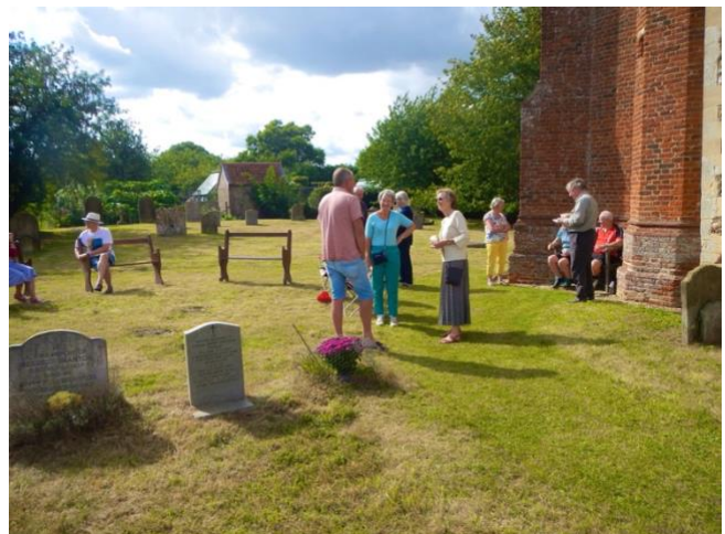
Refreshment in the sunshine St Andrew & St Eustachius, Hoo