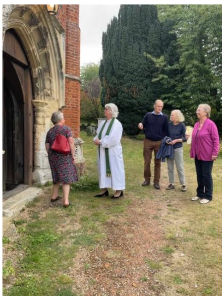
Conversation after a Service: St Peter's, Charsfield