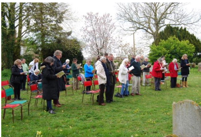
Benefice Rogation Sunday 2021 – Monewden St Mary's

We are looking for a priest who will work with, and alongside, the existing congregations and Ministry Team to explore new avenues of mission and outreach.