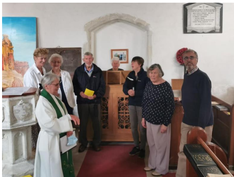
Conversation after a Service: St Mary's, Monewden.