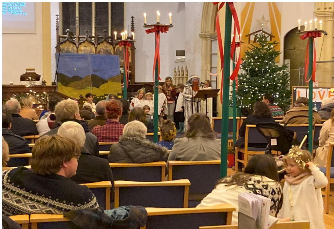
Our Christingle service.

The nearby A12 gives easy access to Ipswich, and places further afield.