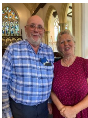
Members of our Welcome Team