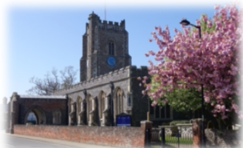
St Peter and St Paul, Aldeburgh