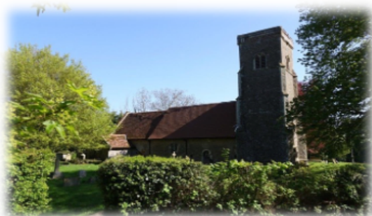
St Lawrence, Knodishall