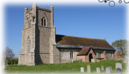
St Mary the Virgin, Friston