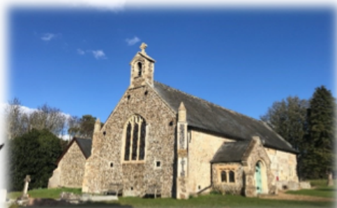
St Andrews, Aldringham