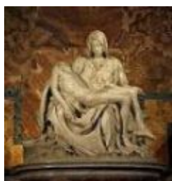
Photo: Michelangelo's Pietà

May the God who brings new life and hope fill you with His joy this Easter.