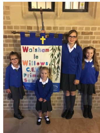
Photo: pupils from Walsham le Willows CEVC School with school banner